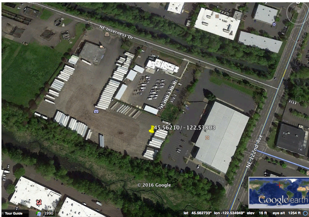
Google Earth view of McKinney Trucking yard in Portland, OR, where LCDs were stored for many months before moving to Seattle to be exported. Yellow Push Pin marker on precise GPS reading. Screen shot made on April 26, 2016.