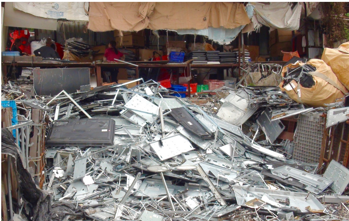
One of three locations BAN visited where the LCD tracker from Total Reclaim ended up and was presumably processed. Many CCFL tubes were broken and tossed into this pile. March 2016.