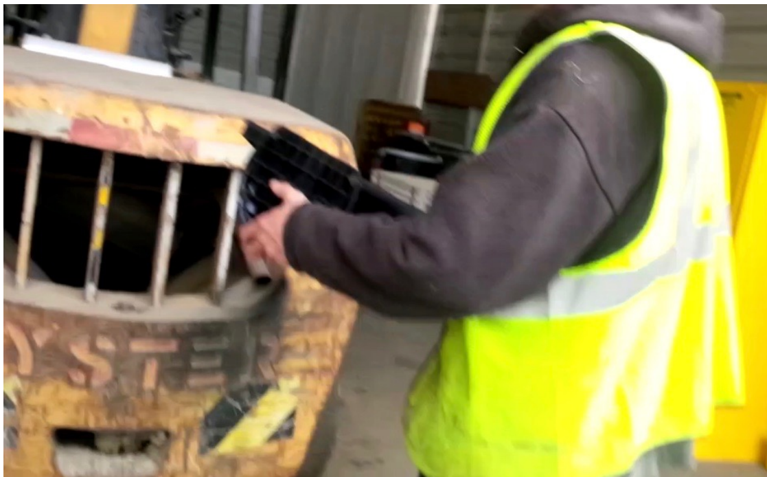
Tracker-enabled LCD being received at ROMR. May 2015.