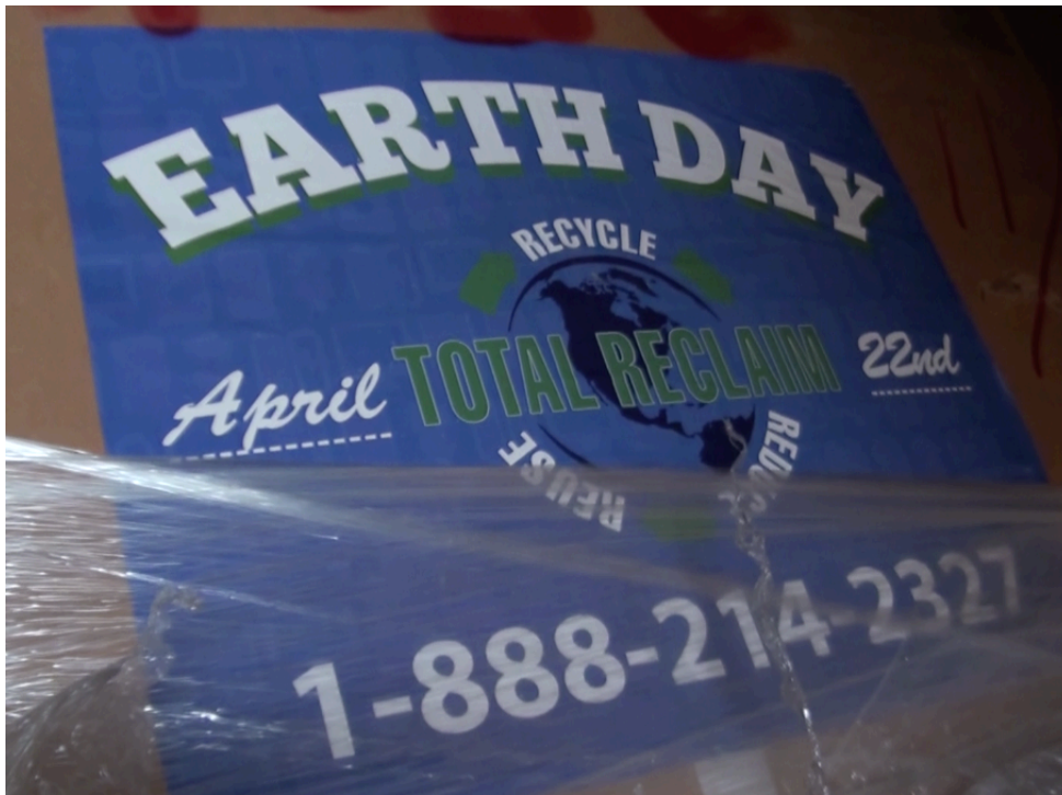
Label on one of the Gaylord boxes from Total Reclaim found in informal electronics recycling operation in Hong Kong. March 2016.